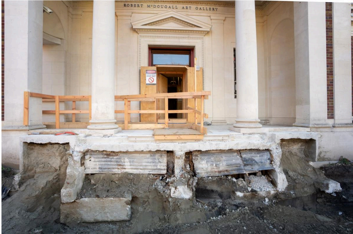
Contractors are preparing to demolish and excavate out the old Robert McDougall Gallery basement.