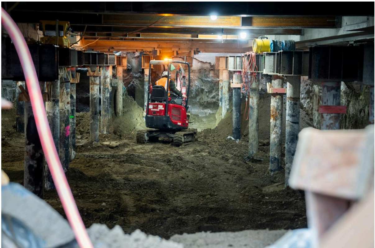
A worker excavates soil from beneath the Robert McDougall Gallery.

As well as construction progress on the new Museum, we are pleased to open a new exhibition at the Canterbury Museum Pop-Up this week. Tails from the Coasts offers a fascinating view of Singapore's wildlife through a series of whimsical watercolours, on loan from the National Museum of Singapore. You can read more about this below.