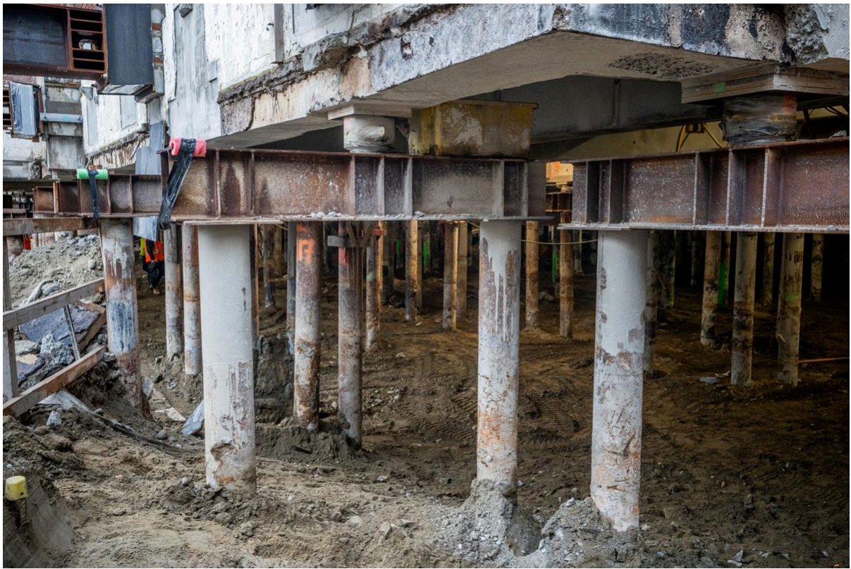
The Robert McDougall Gallery now stands on a series of steel beams sitting atop more than 300 micropiles.