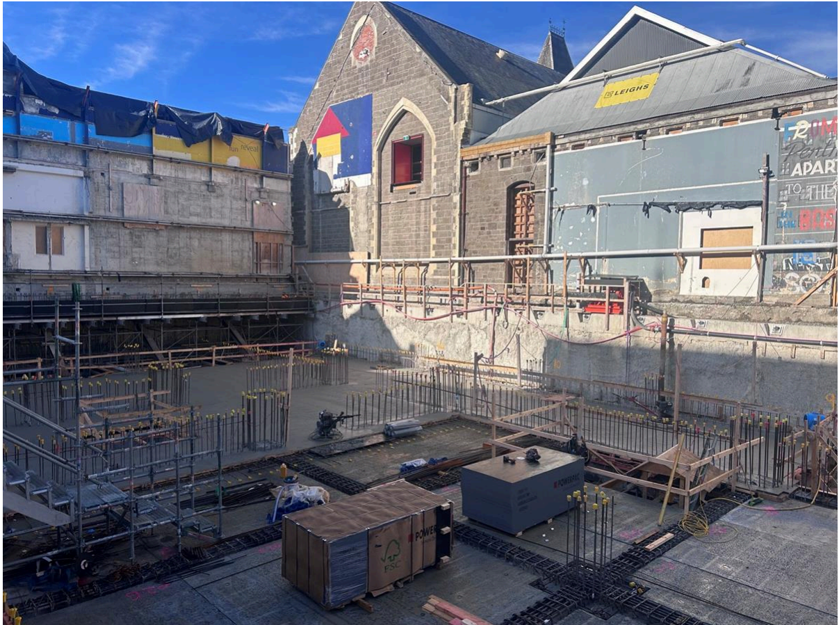
The floor of the new base-isolated basement is taking shape.

The outer basement floor for the new building is largely complete. About 2,100 cubic metres of concrete have been poured for the floor and reinforced with 347 tonnes of steel. Work on the base-isolated inner basement, which will house the Museum collection store, is also well advanced. If you're passing the site, you can see the basement floor taking shape through the fence on Rolleston Avenue or from the Botanic Gardens.