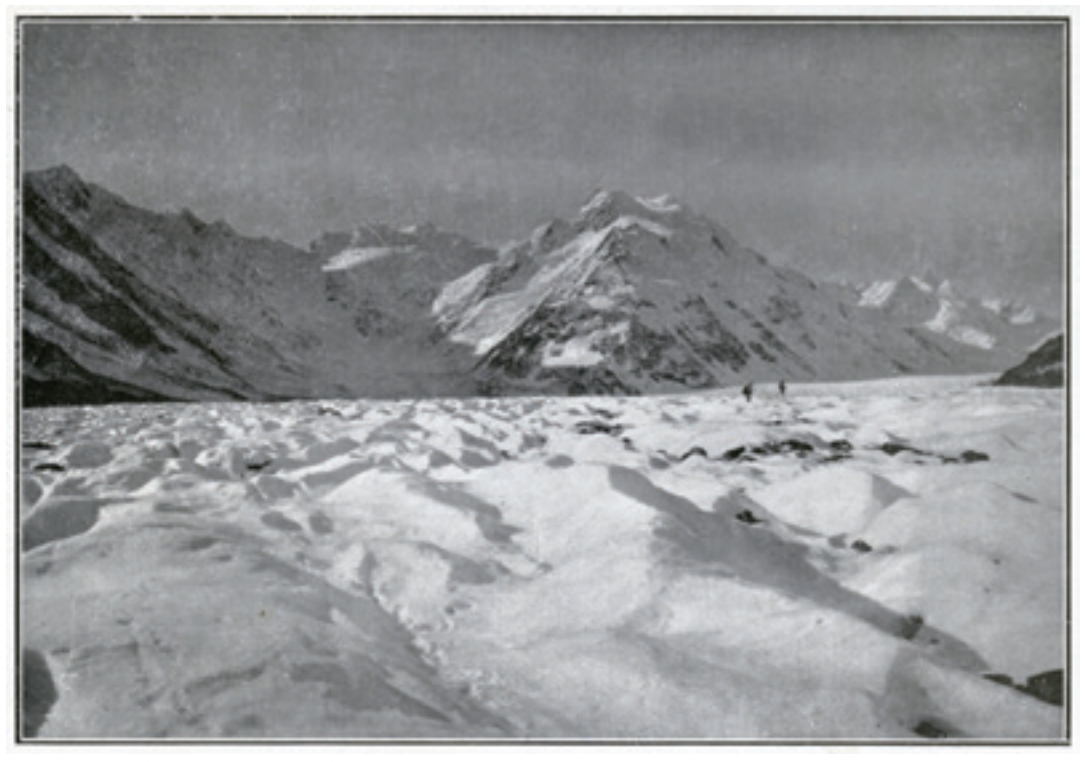
Figure 7. On the Great Tasman Glacier, 1910.

to a series of similar essays published in booklet form, one of which was 'Snow Kings'. On the Great Tasman Glacier (Fig. 7) from that earlier publication (1908: 47) is a particularly fine example of Kinsey's mountain photography and today provides evidence of the extent to which the glacier has retreated. The Press also recognised the booklet's value, describing it as "admirably adapted for sending to friends at a distance as a souvenir of New Zealand" (23 December 1911: 7).