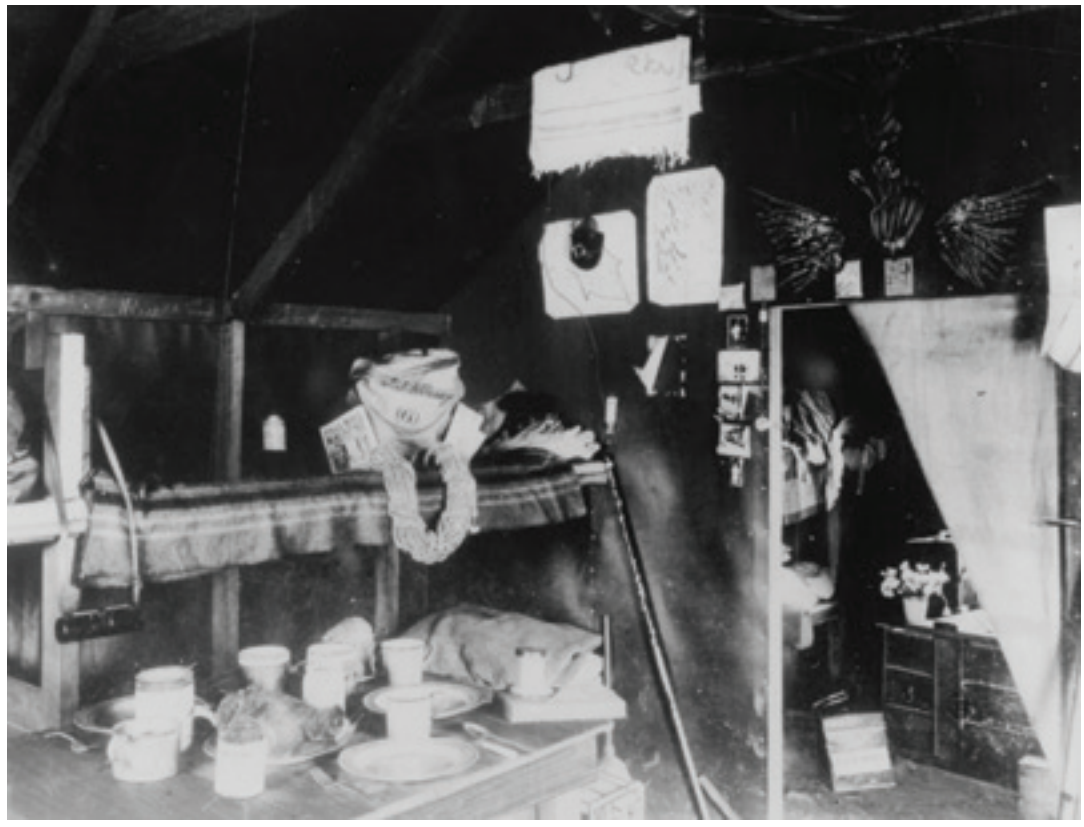
Figure 3. Interior of Ball Hut during Kinsey's stay there in May 1895. Kinsey Collection, Canterbury Museum 19XX.2.5309